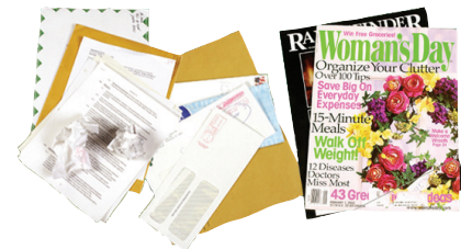
Mail, Magazines, Mixed paper Mail, Revistas, Papel Mixto