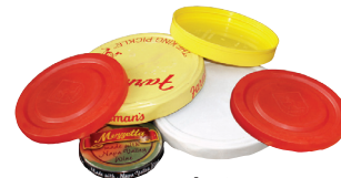
Lids (wider than 3 in.) Tapas (más ancha de 3 pulg.)