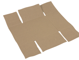
Flattened Cardboard Flattened Cartón