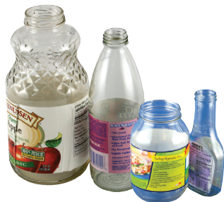
Bottles & Jars Botellas y tarros