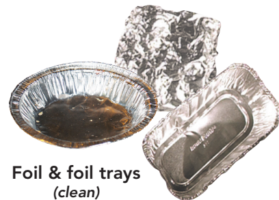
Foil & foil trays (clean) Película PVC y papel de aluminio bandejas (limpio)