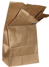
Empty paper bags Bolsas de papel vacías