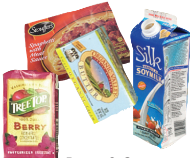
Boxes & Cartons Cajas y Cartones