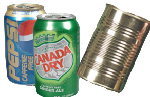
Aluminum & metal cans Latas de aluminio y metales