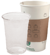
Paper & Plastic cups Productos de papel y de plástico tazas