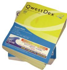
Phone books Guías Telefónicas