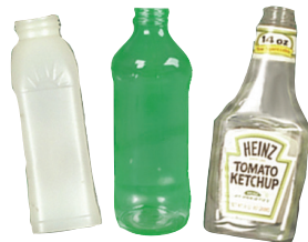
Plastic bottles (all colors) Las botellas de plástico (todos los colores)