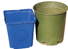
Plastic plant pots Macetas de plástico